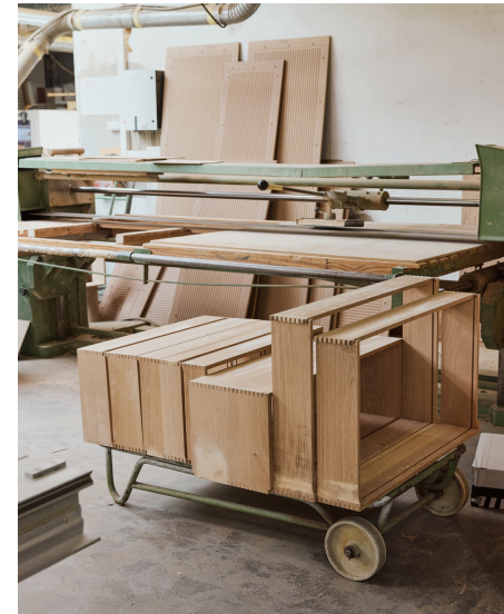
A defined direction

The Signature Collection is built around three design expressions: Solid, Hoelgaard and Layer. Each expression represents a distinct design logic rooted in proportion, material and construction.